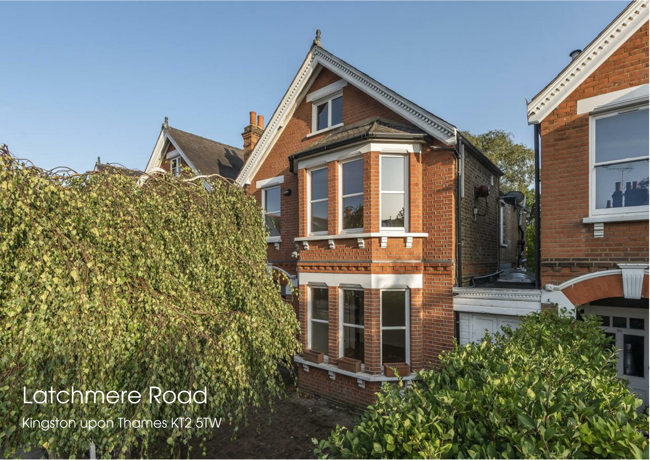
Latchmere Road Kingston upon Thames KT2 5TW

34 Richmond Road Kingston upon Thames Surrey KT2 5ED www.gibsonlane.co.uk Tel: 020 8546 5444